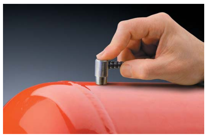
UTG M Multiple Echo Thru-Paint probe measures the thickness of a painted structure without having to remove the coating.