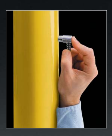
UTG M Thru-Paint models measure the metal thickness of a painted structure without having to remove the coating.

Measures the wall thickness of materials such as steel, plastic and more