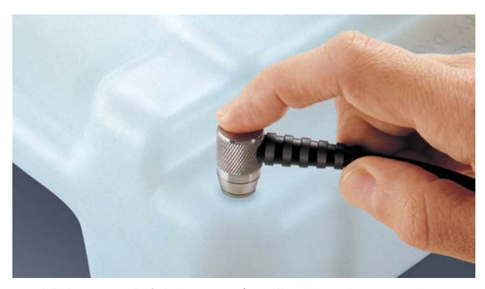
Visit www.defelsko.com/applications.htm to view Inspection Application Notes